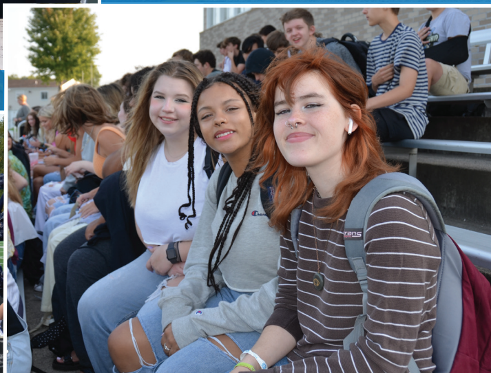
Seniors gathered in Pesonen Stadium for a class photo.