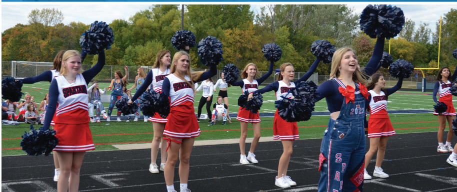
The Homecoming Parade and Pepfest on September 30 brought the community together!