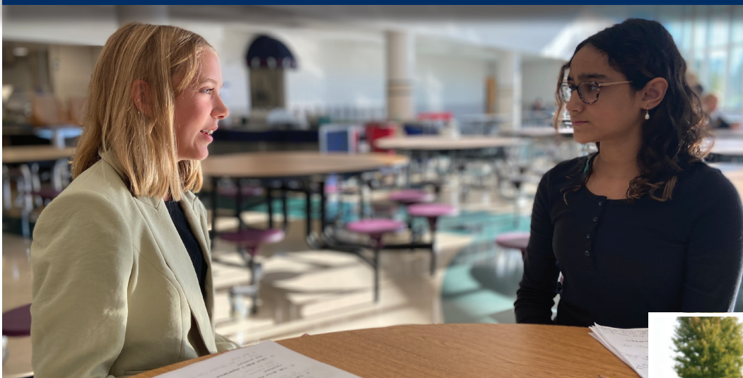
Eighth-grade students engage in mock job interviews, only one component of their career exploration project in the Academic Planning class.