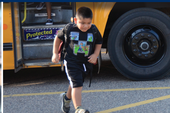
Dashing to class on the first day...!