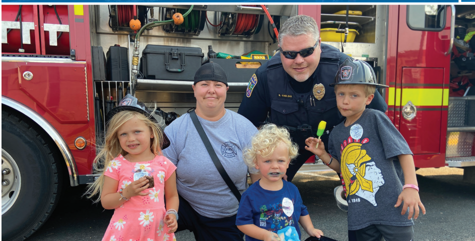
Orono Early Learning students and families tour classrooms, enjoy some ice cream and meet first-responders at the back-to-school Discovery Center Open House.